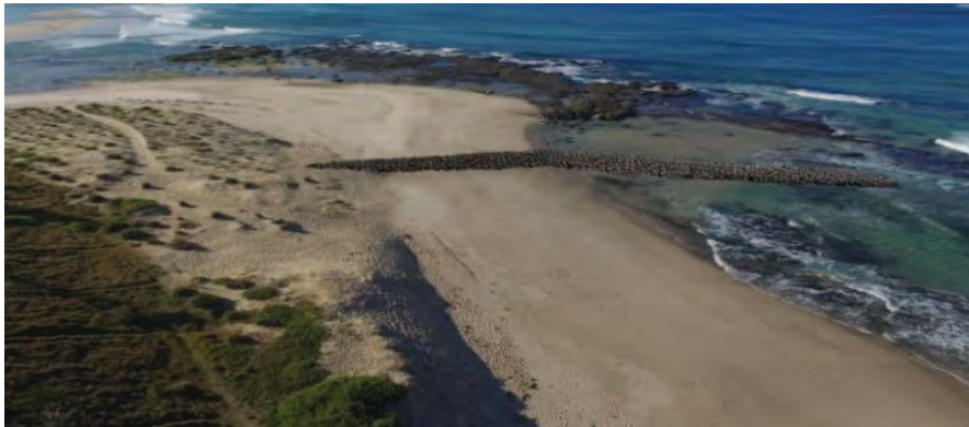
Artist's impression of the proposed rock groyne

In the 2015/16 Budget, the NSW Government allocated $2.4 million to construct a rock groyne on South Entrance Beach, located just to the south of the Surf Life Saving Club tower.